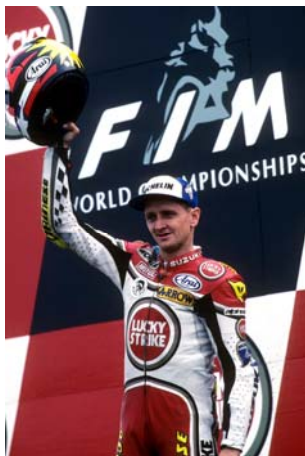
Mr. Kevin Schwantz won the championship of WGP in 1993