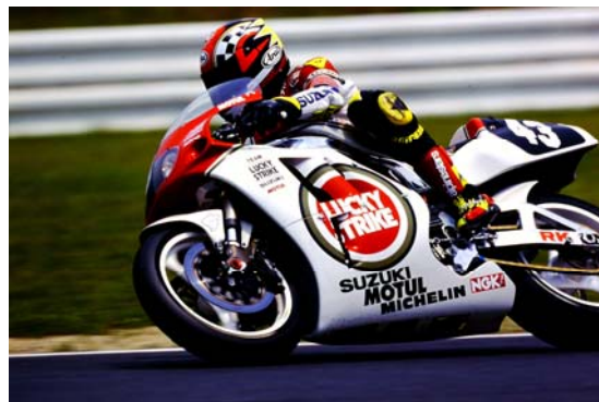
Mr. Kevin Schwantz at 1992 Suzuka 8 Hours