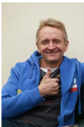
Mr. Kevin Schwantz

-- I absolutely want to win the Suzuka 8 Hours --